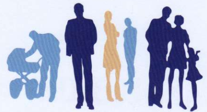
John Alexander Federal Member for Bennelong

Delivery Address: PO Box 872 EPPING NSW 1710