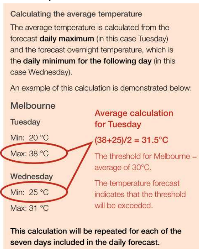
Figure 2: Example calculation of the daily average temperature

Whilst the department will be monitoring forecast temperatures across the state, it is important for councils to continue to monitor local conditions. It may be necessary for councils to activate heatwave plans in the absence of a heat health alert being issued. Council contacts are encouraged to monitor local conditions using the Bureau of Meteorology forecasts and act accordingly.